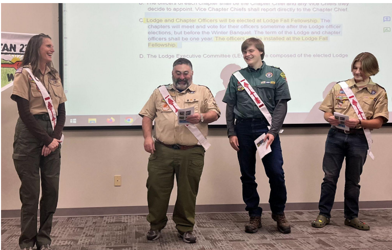
Last year's Vigil Honorees enjoy a light-hearted moment at the Winter Banquet, as they struggle to pronounce their Native American Vigil names.