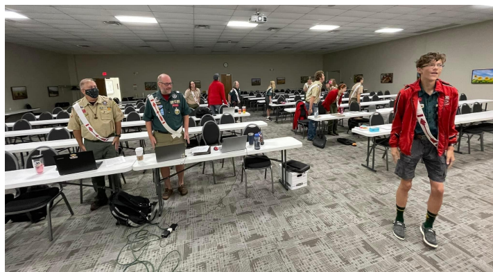
Fun was had by all at last year's Lodge Leadership Development

Lodge Leadership Development, or LLD, is being turned into an overnight event this year! It will be held at Morton Opportunity Club on November 3-4. LLD is a fantastic opportunity for anyone looking to get more involved with the Lodge, or for those who already have leadership roles in the Lodge to gain more experience. Plus, it'll be tons of fun! Watch social media and emails for a registration form closer to the time.