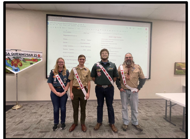
The Lodge recognized those who received Vigil honors this past year.