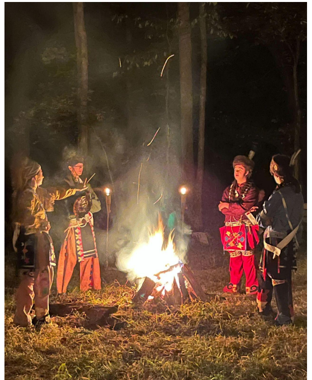
Our Ceremonies Team prepares (above), boat house winter prep (below), Welcome Orientation at the Centennial Chapel.